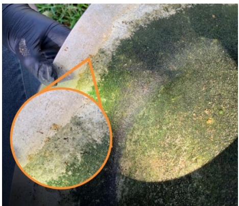
(Aedes aegypti egg seen from naked eye)