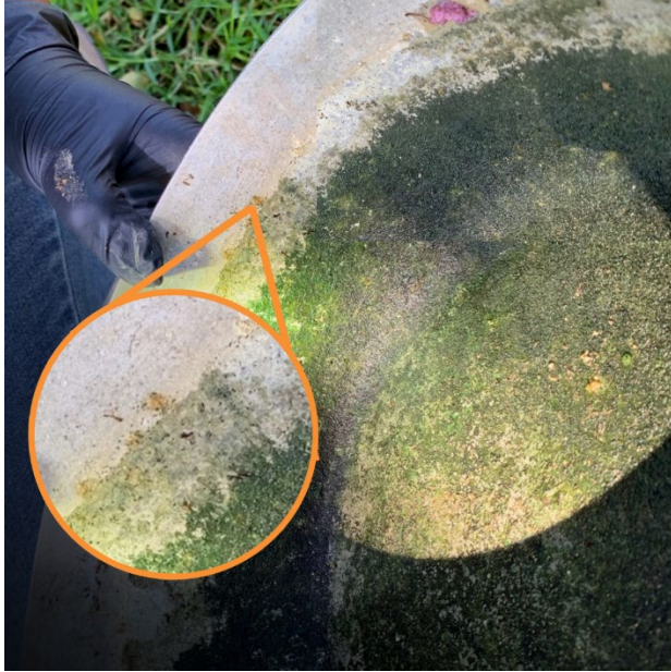
(Aedes aegypti egg seen from naked eye)