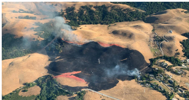
A grass fire in unincorporated Santa Clara