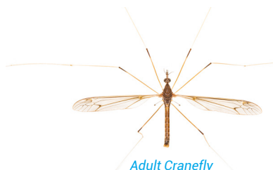
Adult Crane fly