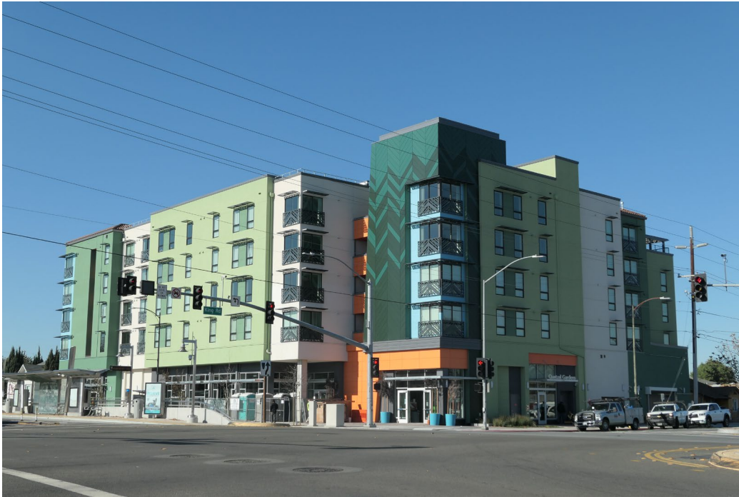
Quetzal Gardens, San Jose