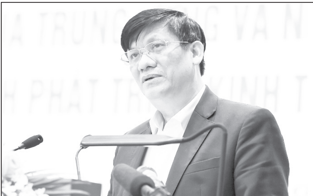
Bộ trưởng Y tế Nguyễn Thanh Long.