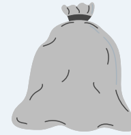
plastic trash bag