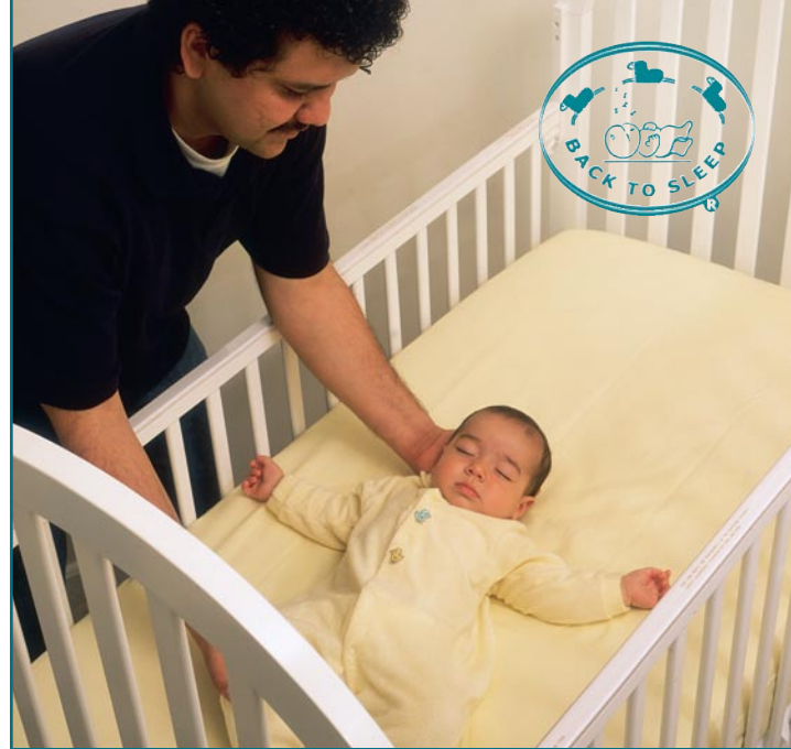
Always place your baby on his or her back to sleep.

Communities across the nation have made great progress in reducing SIDS! Since the Back to Sleep campaign began in 1994, the SIDS rate in the United States has declined by more than 50 percent.