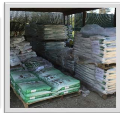
Outdoor materials stored on pallets and covered.

For more information about stormwater pollution prevention