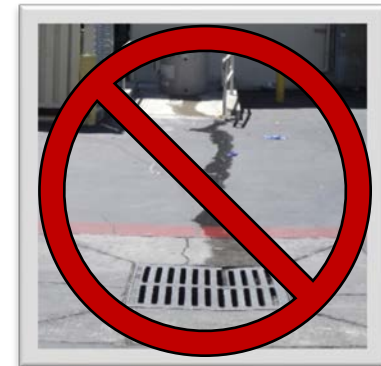
Do not let containers leak.