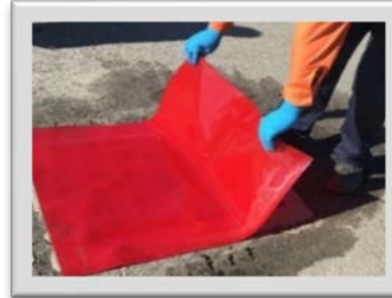
Rubber mat to protect storm drain.