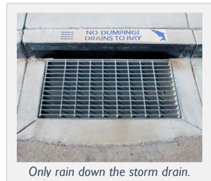
Only rain down the storm drain.