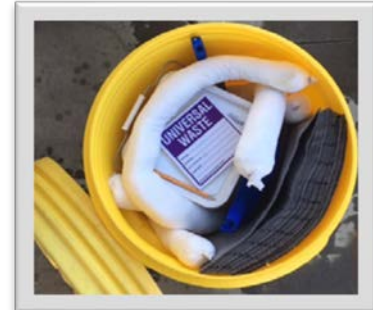
Example spill kit.